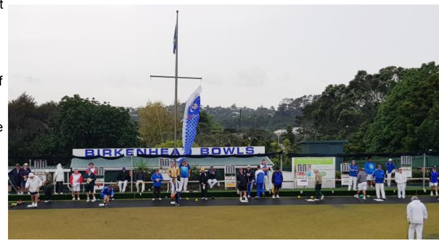
Two full greens for another successful Wheels on Wairau Seafood tournament

Sunday dawned fine, a stunner of a morning and the forecast was all good for three rounds of ten ends per game. All of the previous day's unbeaten teams, with the exception of McCleod, lost their first game Sunday.